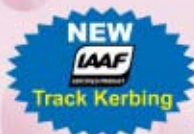
NEW IAAF Track Kerbing