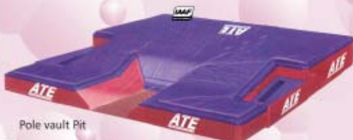
Pole vault Pit